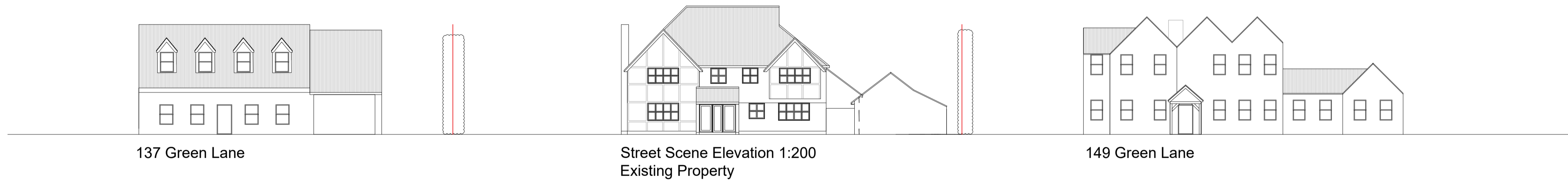
137 Green Lane